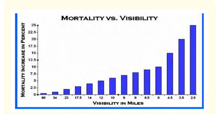
Figure 7: Mortality rates in humans increased as function of the decrease in horizontal air visibility caused by chemtrails dust in USA.

A relationship was found by American scientists between air visibility and human mortality rates that were published by the American Heart Association (AHA) in 2004 [16,17]. Mortality increased mostly among aged persons and infants by 25% when the horizontal air visibility decreased to 2.8 miles (Figure 7).