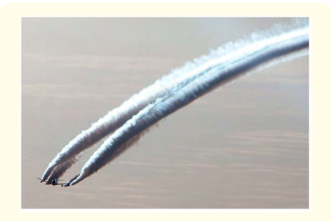
Figure 2: Jet in the stratosphere spraying chemtrails of aluminum oxide (Welsbach particles) and barium salts in the stratosphere.