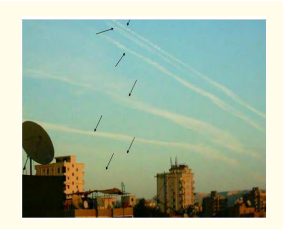
Figure 3: Sprayed chemtrails of the Shield Project seen over Cairo, Egypt, July 2004.

In 2004, El-Husseini recorded the application of chemtrails reached the Mediterranean region and North Africa. The jets were seen leaving their white chemical trails extending from one side of the horizon to the other as watched over Egypt (Figure 3,4).