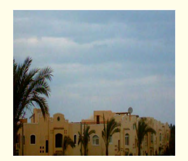
Figure 6: A complete chemtrail cloud formed over Egypt, the trails could be identified in the cloud, Egypt, July 2004.

The existence and exercise of chemtrail spraying in the USA and the whole world has become well known in the last 10 years. It's kind of hard to miss [10]. The vast expense of the project indicates that there are many different aspects to it, as well as a total disregard for human health. Environmentalists and physicians identified and recorded 9 risks on existing resources of our planet and human health as potential unintended consequences or side effects for this first geoengineering global project in the history of mankind.